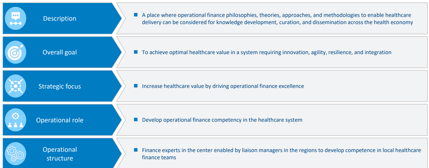
Figure 3: Healthcare finance CoE summary

Most corporate functions are assessed by what it costs to run the function. In addition to delivering increased healthcare value, a CoE for operational finance may bring the added benefit of changing how corporate functions are assessed. By delivering excellence in operational finance and improving healthcare value, effective finance CoEs may succeed in moving healthcare executives away from a focus on the cost of running a corporate function to assessing how the corporate function has contributed to the achievement of healthcare value excellence (see Figure 3). This is no small feat. Therefore, if achieved, healthcare finance operations will deserve a badge of excellence – an honor reserved only for healthcare functions that do ordinary things extraordinarily well .