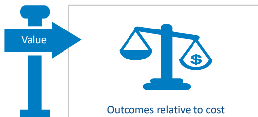
Figure 1: Porter’s definition of value

Source: Harvard Business School, Professor Michael E. Porter