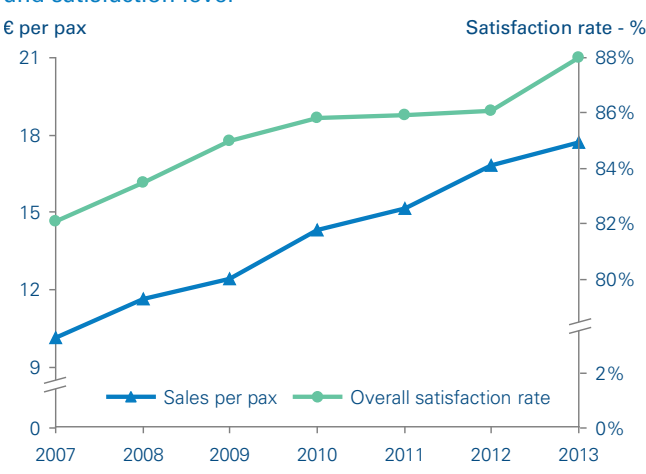
Correlation between spend per passenger improvement and satisfaction level

A successful commercial and services strategy redesign usually involves three main steps: set-up of new aims, an upgraded offer, and a new industrial strategy and closer steering of activities.